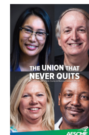
F-7500 Never Quit Brochure