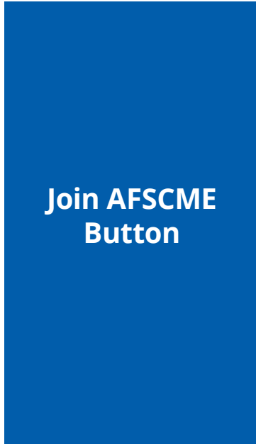
Join AFSCME Button