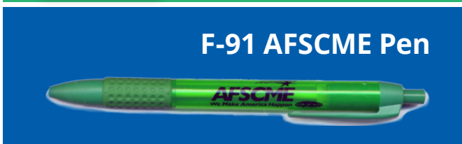
F-91 AFSCME Pen